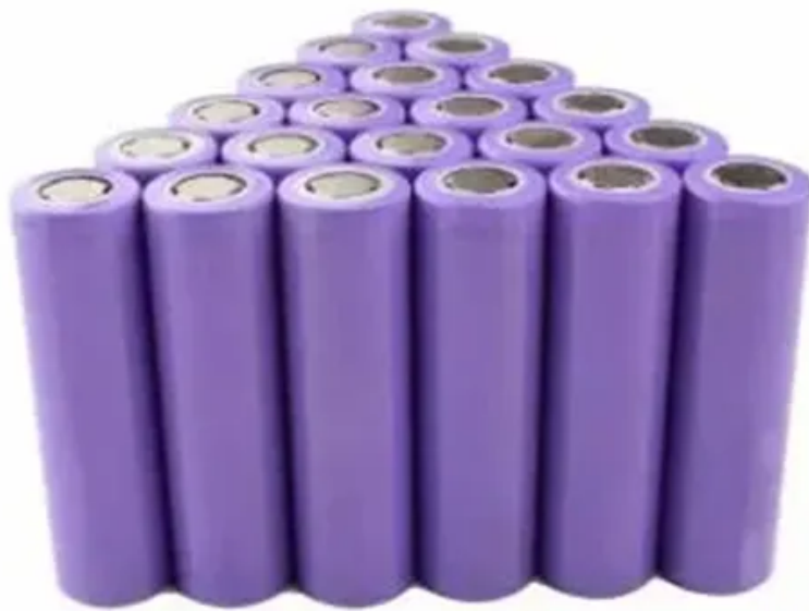
Photo of effective solar container of supercapacitors