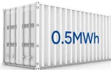
Standard 20ft containers